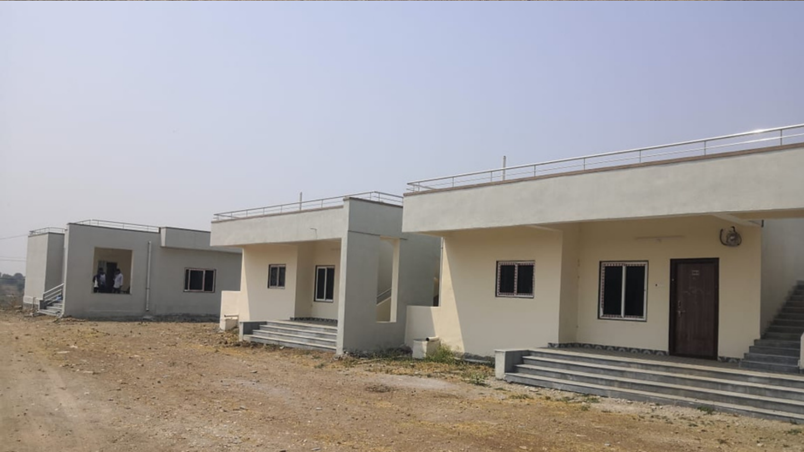
Staff quarters-one side view