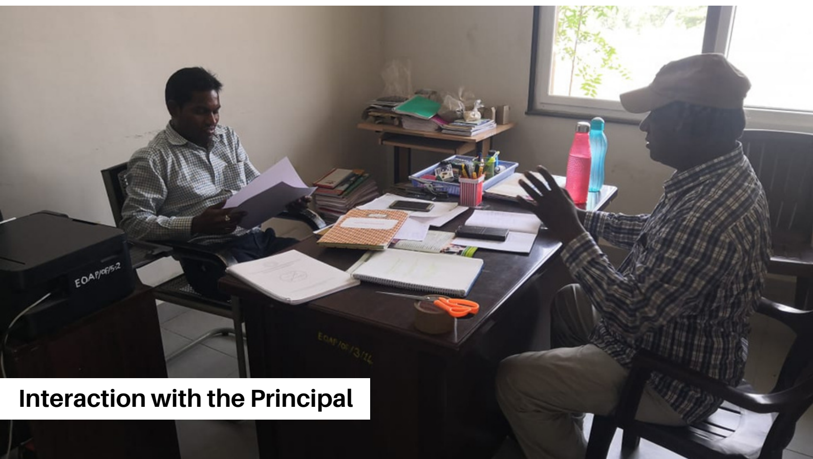
Interaction with the Principal