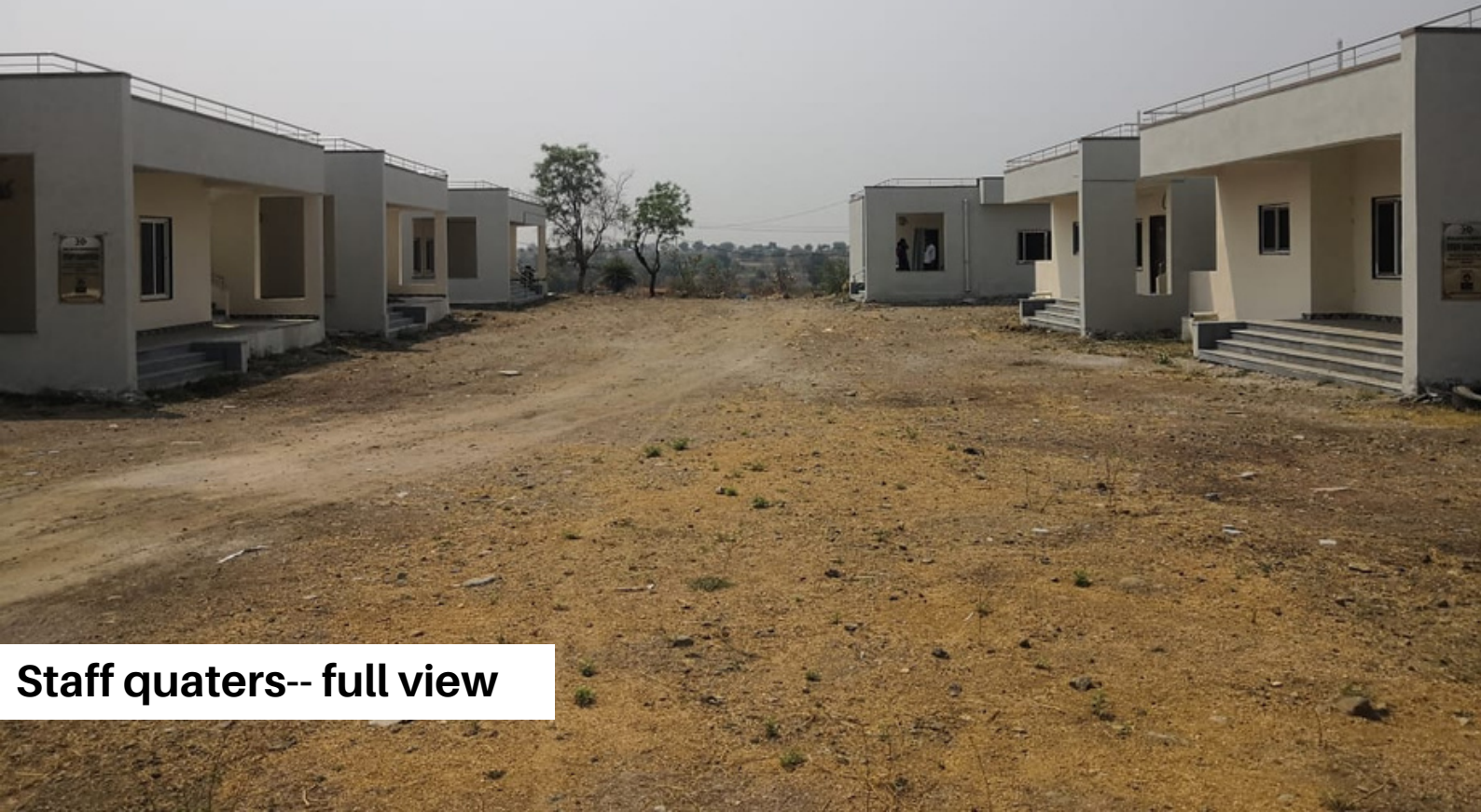
Staff quarters-- full view