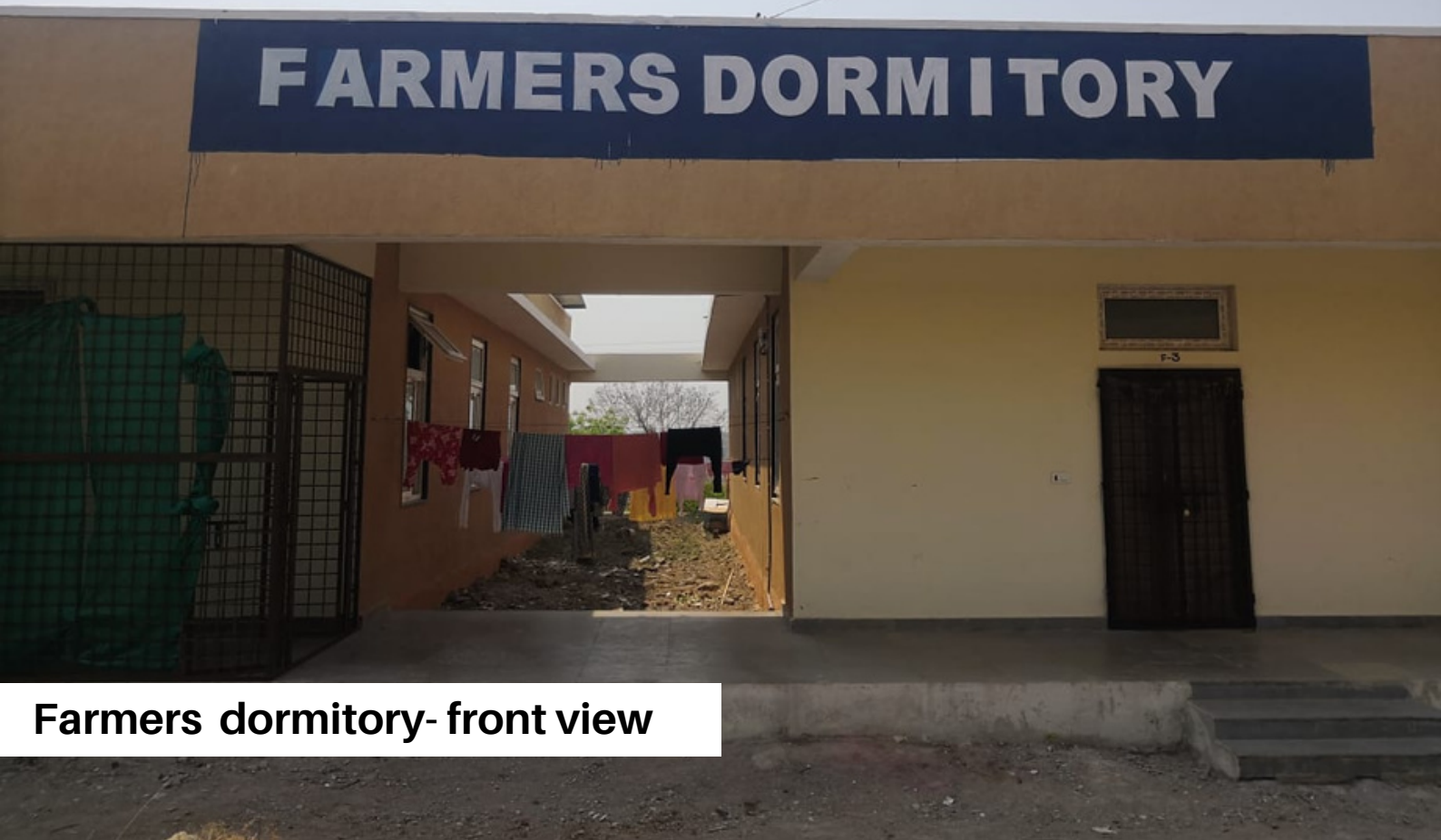
Farmers dormitory- front view