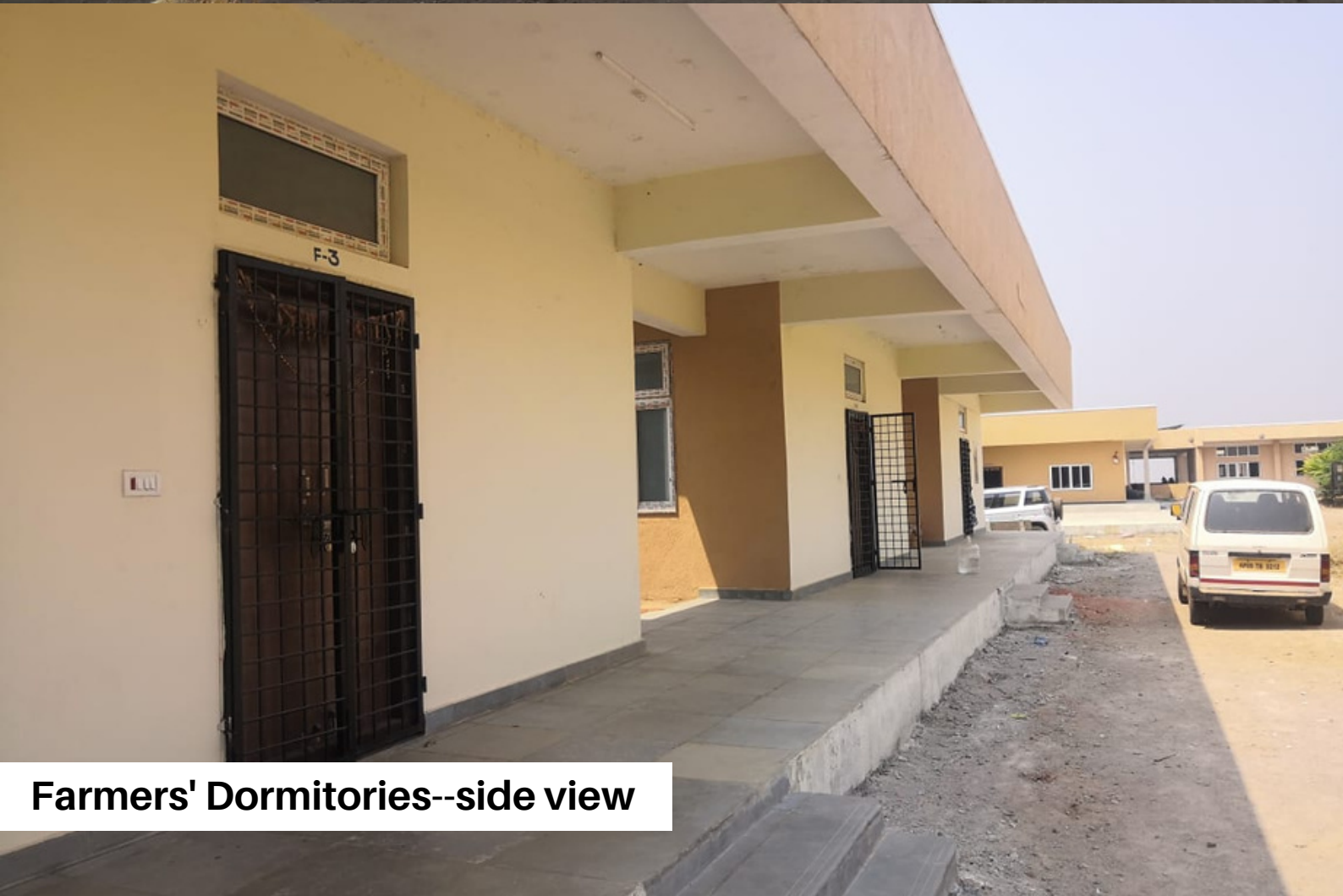
Farmers' Dormitories--side view